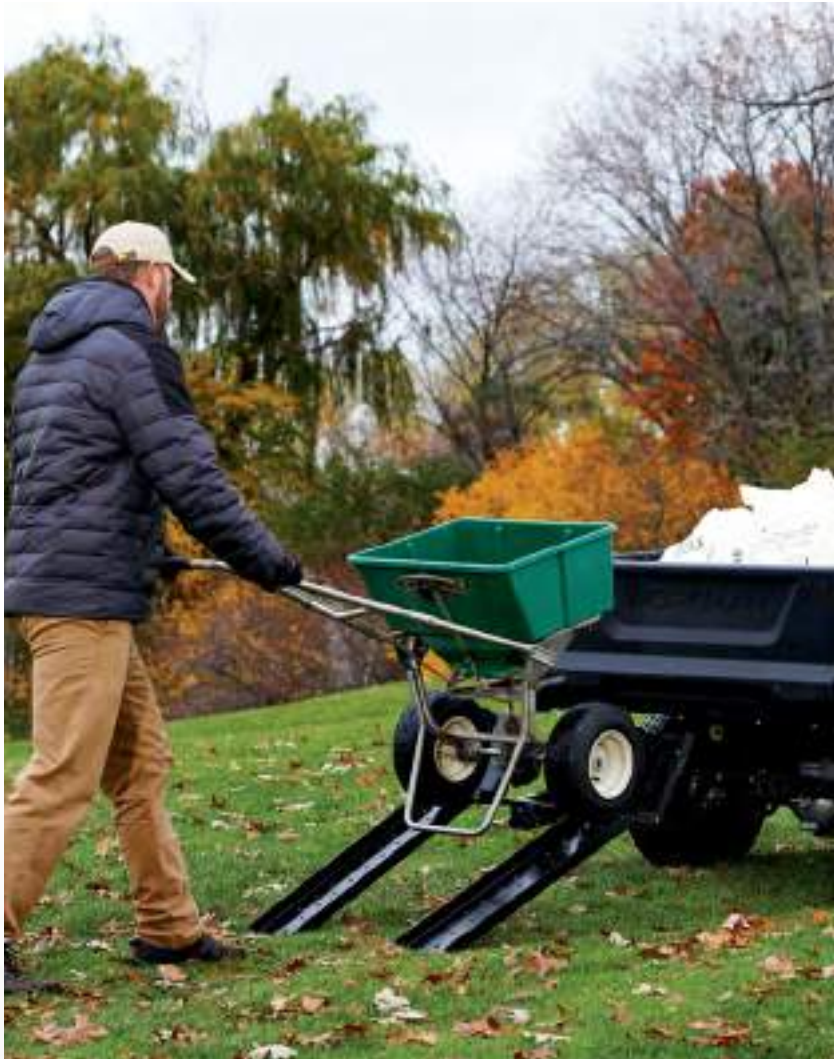
A universal walk spreader mount with self-storing ramps eliminates lifting the spreader in and out of the back of the vehicle. Simply push it up the ramp, store and go.

The Workman® GTX features a standard 1¼ inch (32mm) receiver integrated at the back of the vehicle with an optional front mount. Both mounting points are above the base frame and suspension, minimizing rattling and vibration that occur on traditional drawbar receiver-mounted attachments.