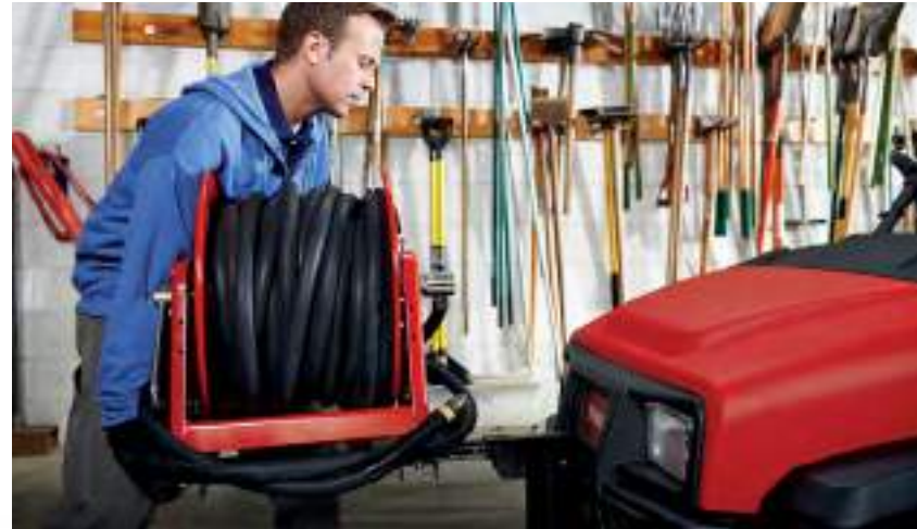
Free up bed space by attaching your hose reel to the optional front or standard rear receiver.