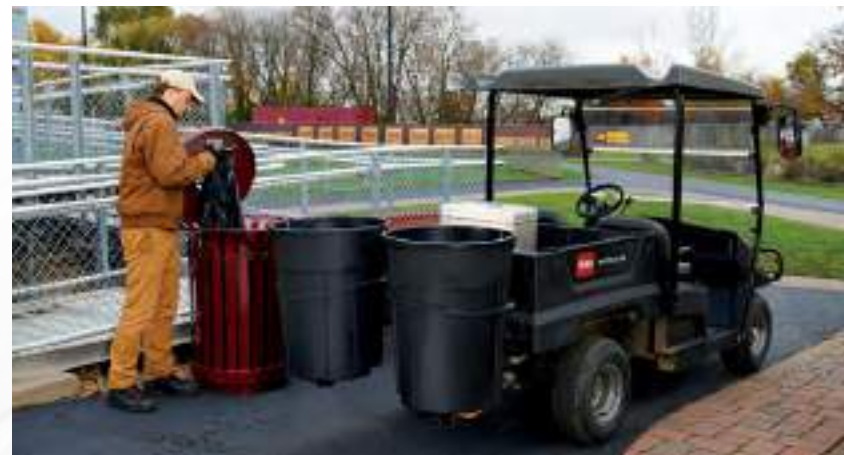
Dual garbage/recycling container mount attachment allows customers to set up a vehicle for morning trash collection, and quickly remove for normal run-around vehicle needs.