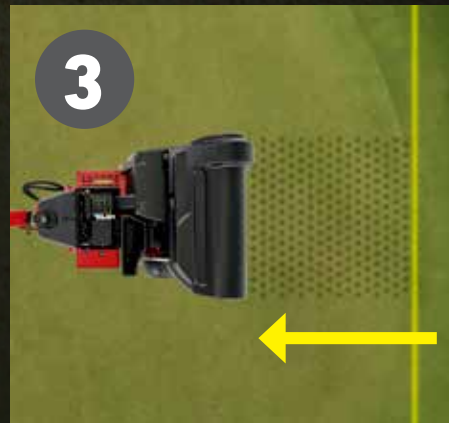
Coring head drops where aeration engaged