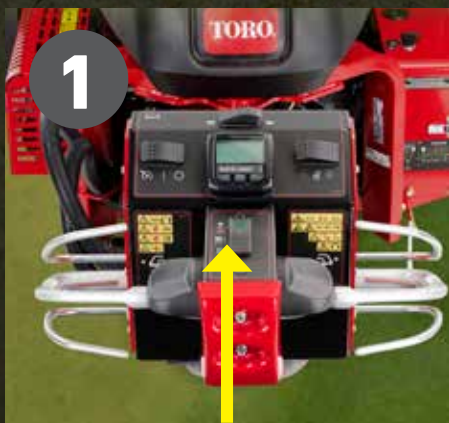
Set selector switch to Delayed Mode

Operating in Delayed Mode unlocks the full potential of the exciting technology on the ProCore 648s, including easily viewing and targeting coring head drop and raise and improving drop performance. When utilizing Immediate Mode, the machine operates as the original ProCore 648 does.