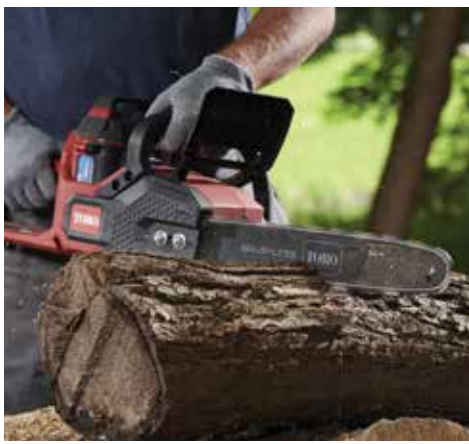
GET MORE DONE

Tensioning tool mounts onboard the chainsaw for quick and easy access.