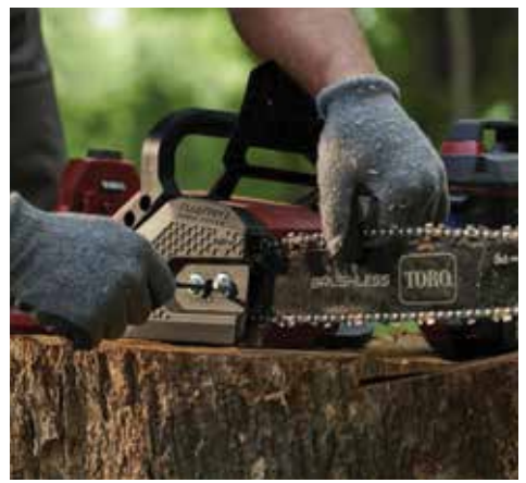
PRO-STYLE CHAIN TENSIONING

Get more power, more runtime, and longer life with the digitally controlled brushless DC motor that provides power when you need it.