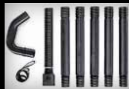
GUTTER CLEANING ACCESSORY KIT Part Number: 51667