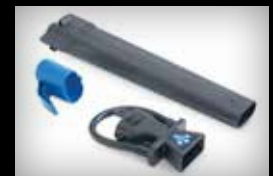
OSCILLATING TUBE ATTACHMENT KIT Part Number: 51664

toro.com Worldwide Headquarters The Toro Company 8111 Lyndale Ave. So. Bloomington, MN 55420 U.S.A. Phone: (1) 952 888 8801 Fax: (1) 952 887 8258