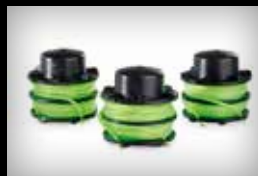
POWERPLEX® 40V STRING TRIMMER 0.08" DUAL LINE SPOOL 3 Pack Part Number: 88546TE