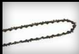
POWERPLEX® 40V MAX LI-ION CHAINSAW CHAIN Part Number: 88581TE