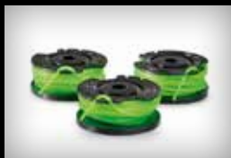
POWERPLEX® 40V STRING TRIMMER 0.08" SINGLE LINE SPOOL 3 Pack Part Number: 88545TE