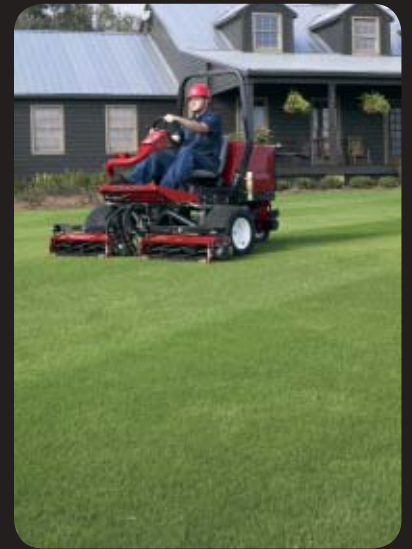
Toro reels deliver a remarkable quality of cut — season after season.

Toro® Reelmaster mowers are lauded for their quality of cut, and the 3100-D is no exception. Your choice of 5, 8 or 11-blade reels let you customize the cutting unit to fit a variety of applications. Variable reel speed adjustment offers even greater operator control while onboard backlapping helps keep blades sharp. All this comes in your choice of 72" (183 cm) or 85" (216 cm) cutting widths to keep you more productive.